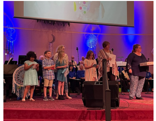
3rd/4th grade Essay Contest